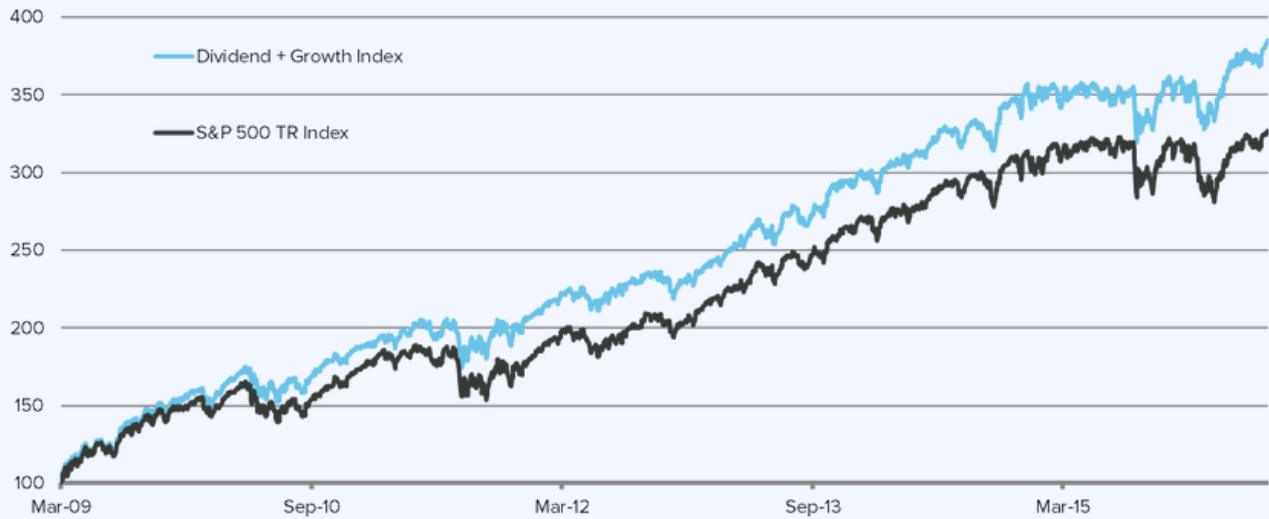
Chart 4: Companies with Strong Cash Flow and Flexible Management Outperform:

similar to the stock valuation side. If we look back at the last 75 years of data, it should be enough data to be representative of what the next 10 years will look like. Although this may be true, I would not rely solely on short term supply demand dynamics without spending some time on the timeline of upcoming innovations and their impact. I would again focus on being long efficiency and short waste. Commodities, to me, are waste and will remain in a secular decline albeit a slower one than what we've seen since 2014.