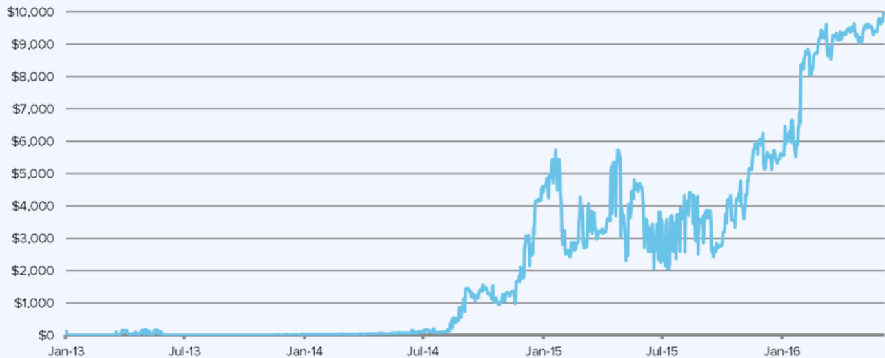
Chart 3: Negative Yielding Bonds ($bn)